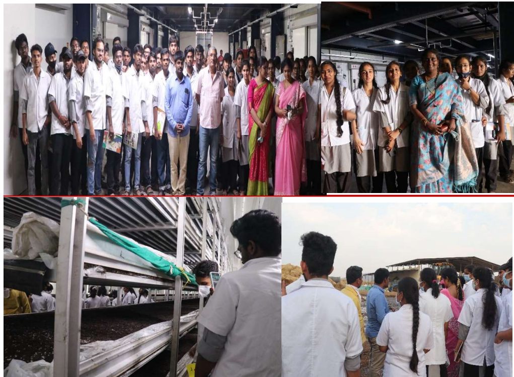
Photo Gallery of the Event

90 students in BBC and MBC groups visited the the fresh bowl mushroom culture unit at orvakalu village, atmakur, Kurnool.